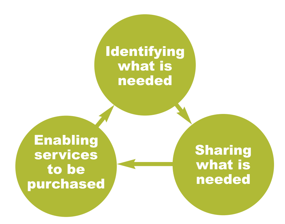
Figure 1: Three key market shaping activities to support individual purchasing

To ensure that local authorities can fulfil their duties, market shaping to support individual purchasing can be broken down into three key activities as shown below: