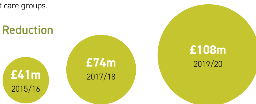
Adult Social Care Cumulative Net Budget Reduction since 2015